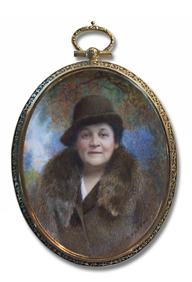
Figure 9: Wealthy American Lady Wearing a Mink Stole

by Marion Hoffman Hartman circa 1930-35 watercolor on ivory 2 7/8 x 3 3/4 inches (sight)