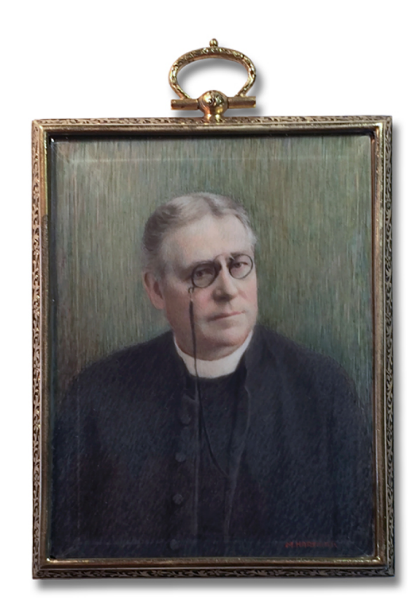
Figure 7: Roman Catholic Priest of the Early Twentieth Century

It is ironic, of course, that photographs would form the basis of so many early twentieth century miniature portraits when one considers that it was the onset of photography in the mid-nineteenth century that nearly displaced the entire miniature portrait painting profession. During the last decade of the nineteenth century and the first two decades of the twentieth century, however, miniature portraiture experienced a renaissance - one partially borne of the merging together of photography and painting. Some artists of the period simply utilized photographs as a model for their paintings, rather than observing and painting a live sitter. Others, like Marion Hartman, chose to paint over faint photographic bases. Of course, some were more skilled at painting over photographs than others (some painting with fluid and detailed brush strokes, and others simply shading). It can be said, too, that the quality of work of even the finest painters of photographic miniatures varied over the course of their careers; and such was certainly the case with Marion Hartman.