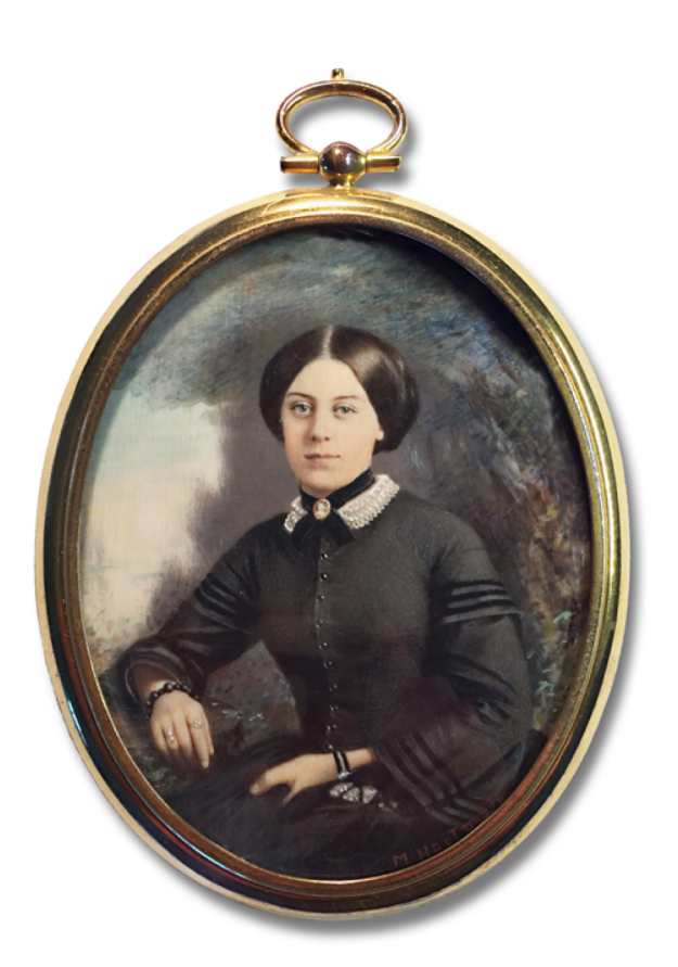
Figure 8: Post-Civil War Era American Lady

by Marion Hoffman Hartman circa 1922 painted from a photograph taken circa 1870 watercolor on ivory 2 1/2 x 3 1/4 inches (sight)